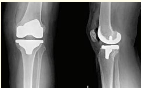
Figure 1: Despite pain and stiffness for this patient, these AP and Lateral radiographic views show satisfactory alignment and component sizing with no evidence of malrotation.

ing a new prosthesis with more internal constraint, increases the risk of complications (e.g. infection or fracture), and may make the post-operative rehabilitation regime more difficult. Surgeons often adopt the “change everything” mentality with respect to component exchange because they do not have specific quantifiable data to analyze knee kinematics and soft-tissue balance of the problem joint. They may also identify a gross problem at time of revision surgery (e.g. a loose component) but not recognize a subtler problem (e.g. malposition, malrotation, soft-tissue instability) as a root cause. It is clear that more empirical methods for evaluating the painful TKA are needed.